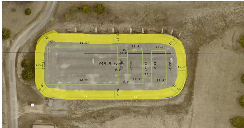
Option 1 Sketch

buffer surrounding the basketball court. 12' clear zone buffers are used in between courts to provide space for participants to safely move around as well as to help contain play to specific courts. Option 1 would have approximately 22' of free space that could be used to further space courts, if desired.